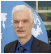
A. Schleicher Director for Education and Skills OECD, Directorate for Education and Skills, Paris, France